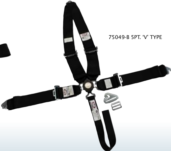
75049-B 5PT. 'V' TYPE