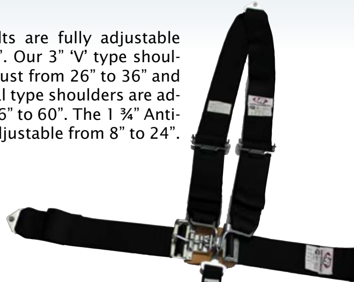
70049-B 5PT. 'V' TYPE BOLT-IN SYSTEM