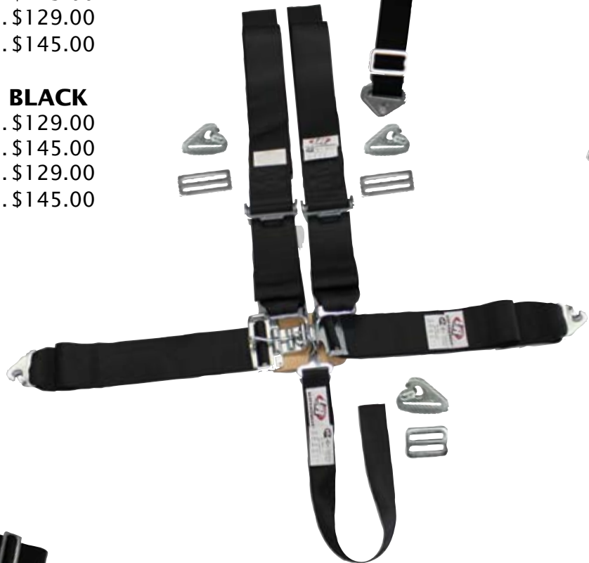
72052-B 5PT. INDIVIDUAL SNAP-IN SYSTEM