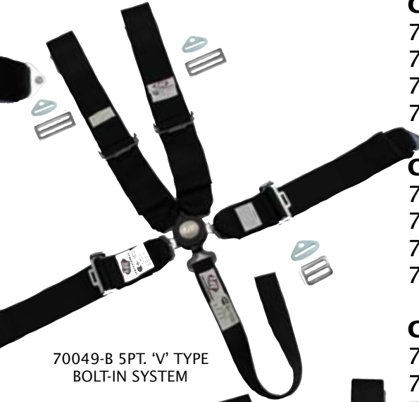
70049-B 5PT. 'V' TYPE BOLT-IN SYSTEM

are current date labeled for Tech inspection. The 3" Lap Belts are fully adjustable from 24" to 60". Our 3" 'V' type shoulder harness adjust from 26" to 36" and the 3" Individual type shoulders are adjustable from 26" to 60". The 1 3/4" Anti-Sub belts are adjustable from 8" to 24".