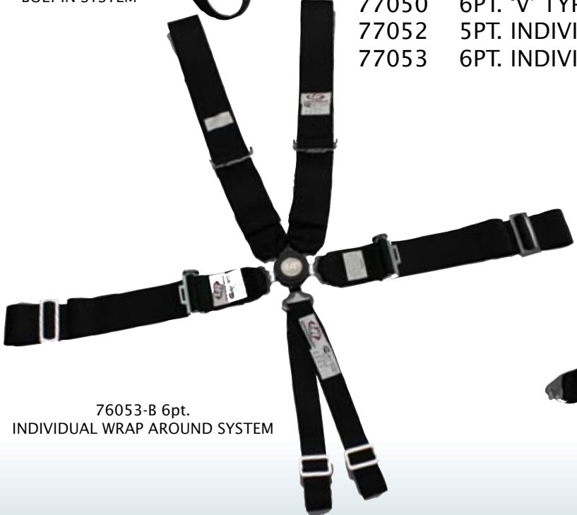
76053-B 6pt. INDIVIDUAL WRAP AROUND SYSTEM