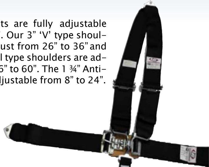
70049-B 5PT. 'V' TYPE BOLT-IN SYSTEM