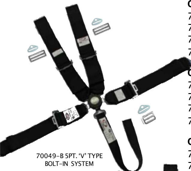
70049-B 5PT. 'V' TYPE BOLT-IN SYSTEM