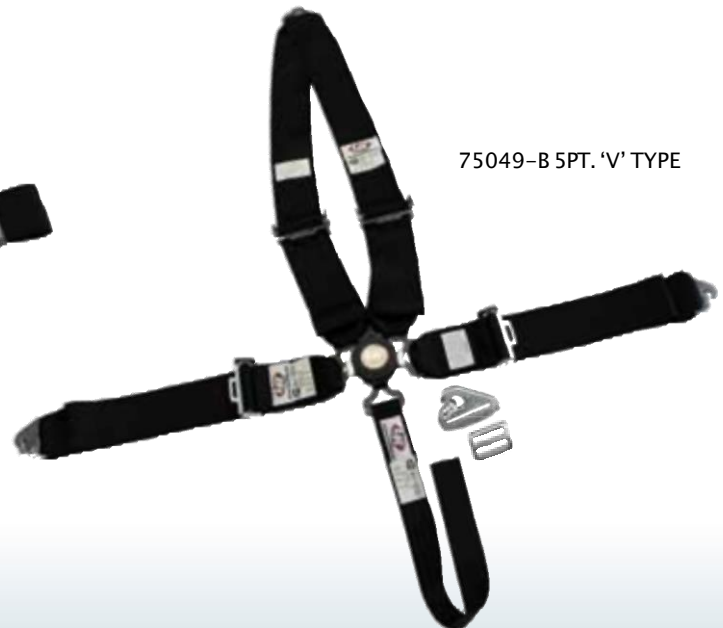
75049-B 5PT. 'V' TYPE