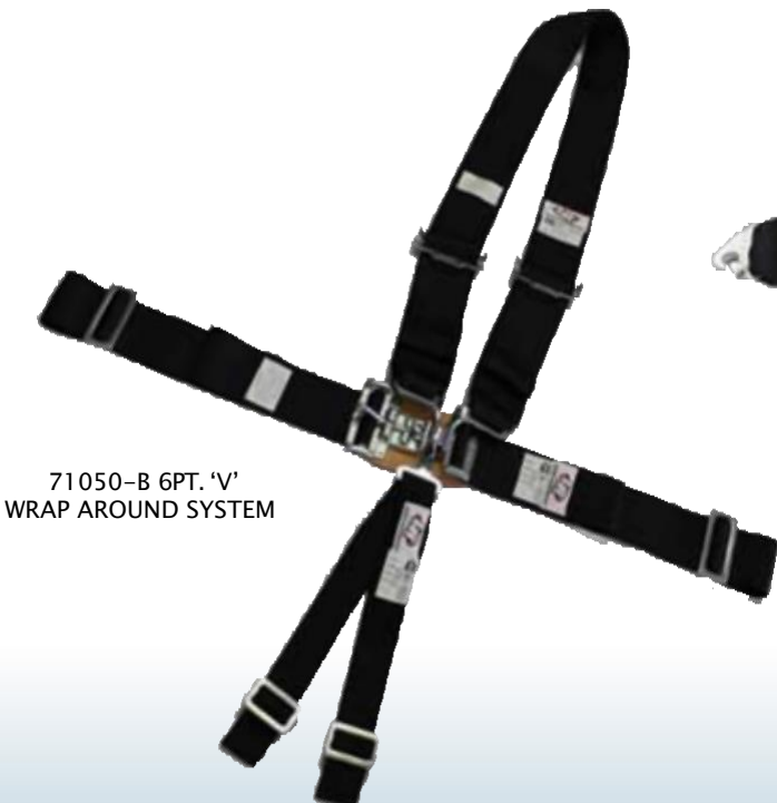
71050-B 6PT. 'V' WRAP AROUND SYSTEM