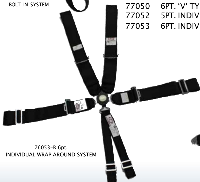
76053-B 6pt. INDIVIDUAL WRAP AROUND SYSTEM