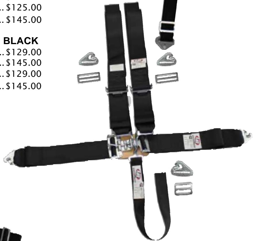
72052-B 5PT. INDIVIDUAL SNAP-IN SYSTEM