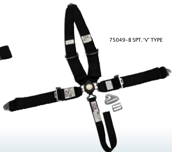
75049-B 5PT. 'V' TYPE