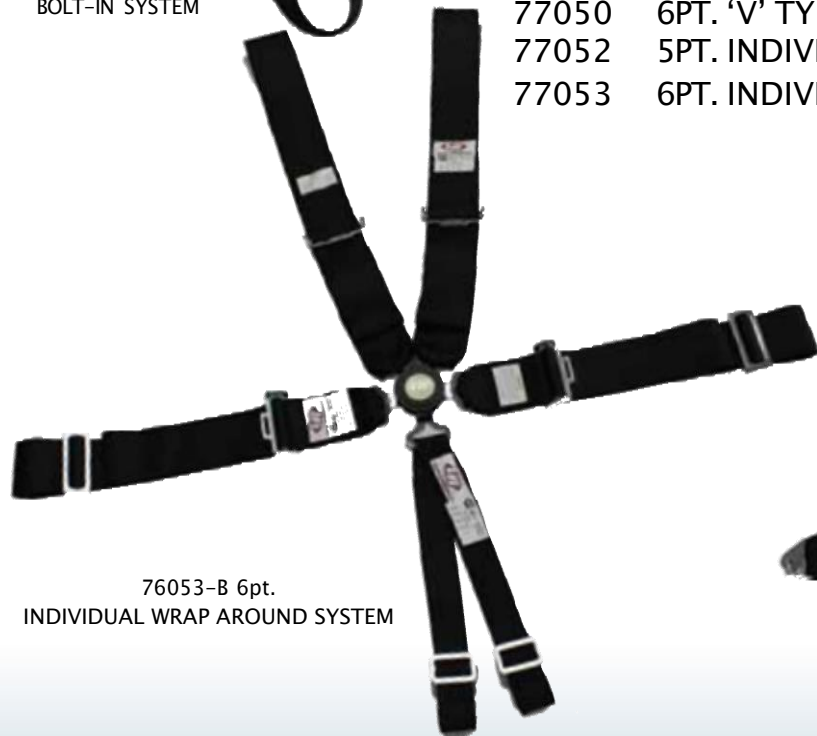
76053-B 6pt. INDIVIDUAL WRAP AROUND SYSTEM