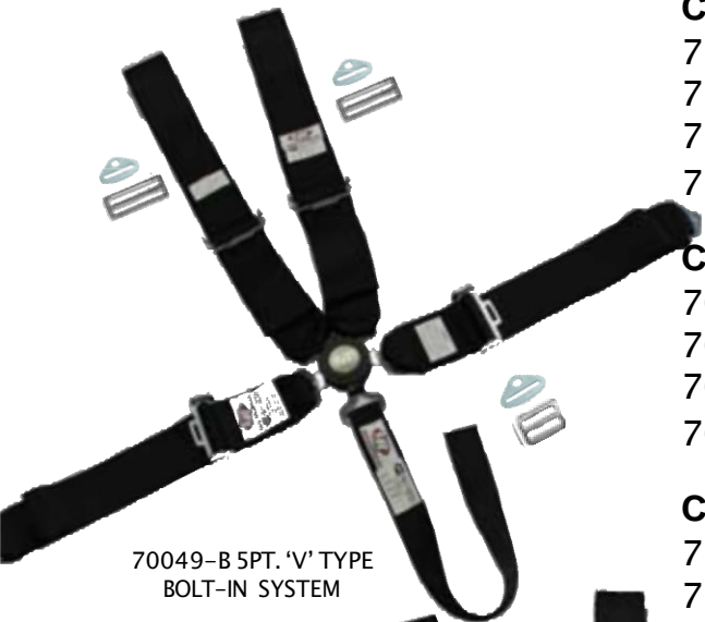
70049-B 5PT. 'V' TYPE BOLT-IN SYSTEM