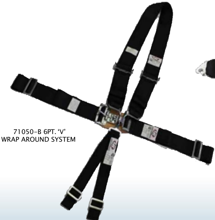
71050-B 6PT. 'V' WRAP AROUND SYSTEM