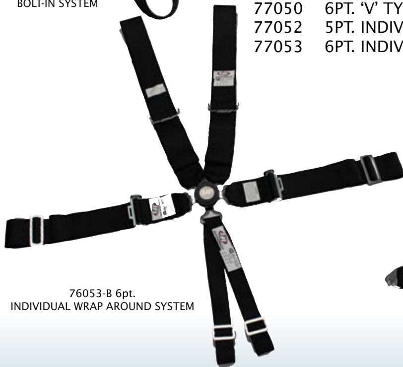
76053-B 6pt. INDIVIDUAL WRAP AROUND SYSTEM