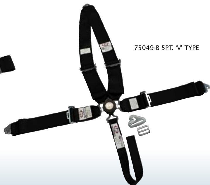
75049-B 5PT. 'V' TYPE