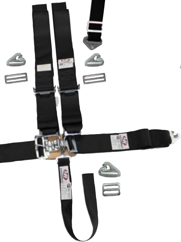
72052-B 5PT. INDIVIDUAL SNAP-IN SYSTEM