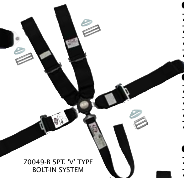
70049-B 5PT. 'V' TYPE BOLT-IN SYSTEM

are current date labeled for Tech inspection. The 3" Lap Belts are fully adjustable from 24" to 60". Our 3" 'V' type shoulder harness adjust from 26" to 36" and the 3" Individual type shoulders are adjustable from 26" to 60". The 1 3/4" Anti-Sub belts are adjustable from 8" to 24".